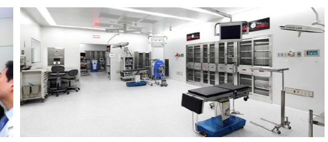
Animal Labs in Research Center